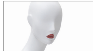
Y1 with removable lips F1