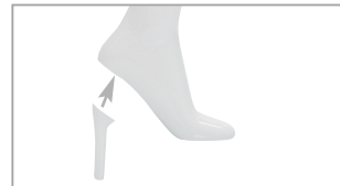
Abstract feet with removable heels