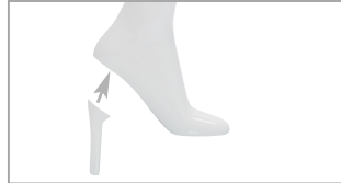
Abstract feet with removable heels