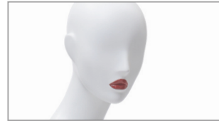
Y1 with removable lips F1