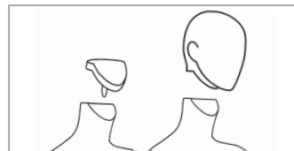
V Nec Cut