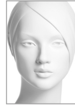
HEAD 1/51 (*)