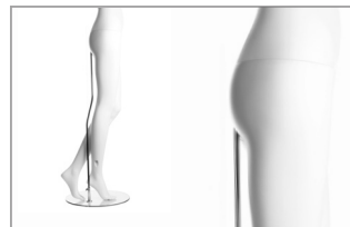
Buttock Fitting (*)