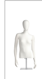
min height 108 cm