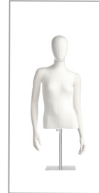
max height 116 cm