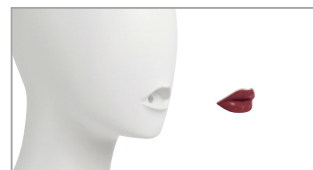
76/1 egg for lips F2