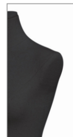
CAP5/80/... No shoulder cap