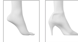
realistic feet sculpted shoes