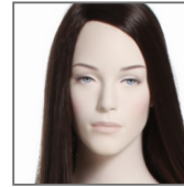
N2 pierced ears