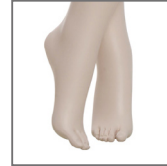
RF3 open toes