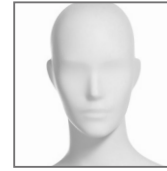
N3 abstract head with ears