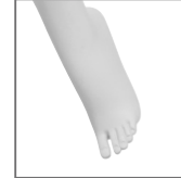
RF3 open toes