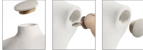
CAP4/72.10/...(*) push and pull ARMCAP1/72.10/..(*)