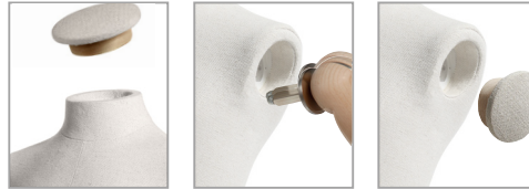
CAP4/72.6/...(*) push and pull ARMCAP1/72.6/...(*)