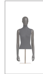
min height 104 cm