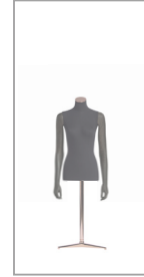
min height 121 cm