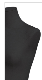
CAP5/80/... No shoulder cap